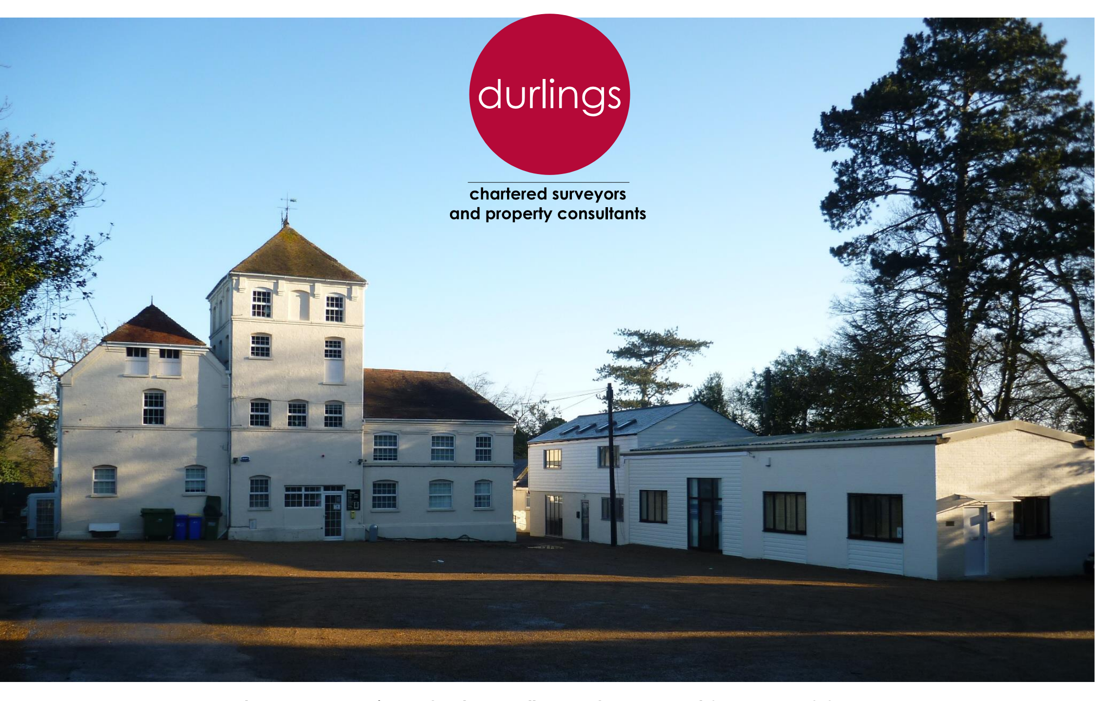
The Brewery Business Centre • Bells Yew Green • East Sussex • TN3 9BD Office suites — For Sale or To Let — 590 sq ft (54.81sq m)