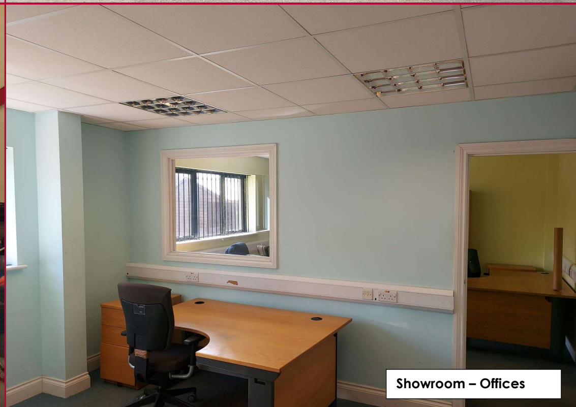
Showroom - Offices