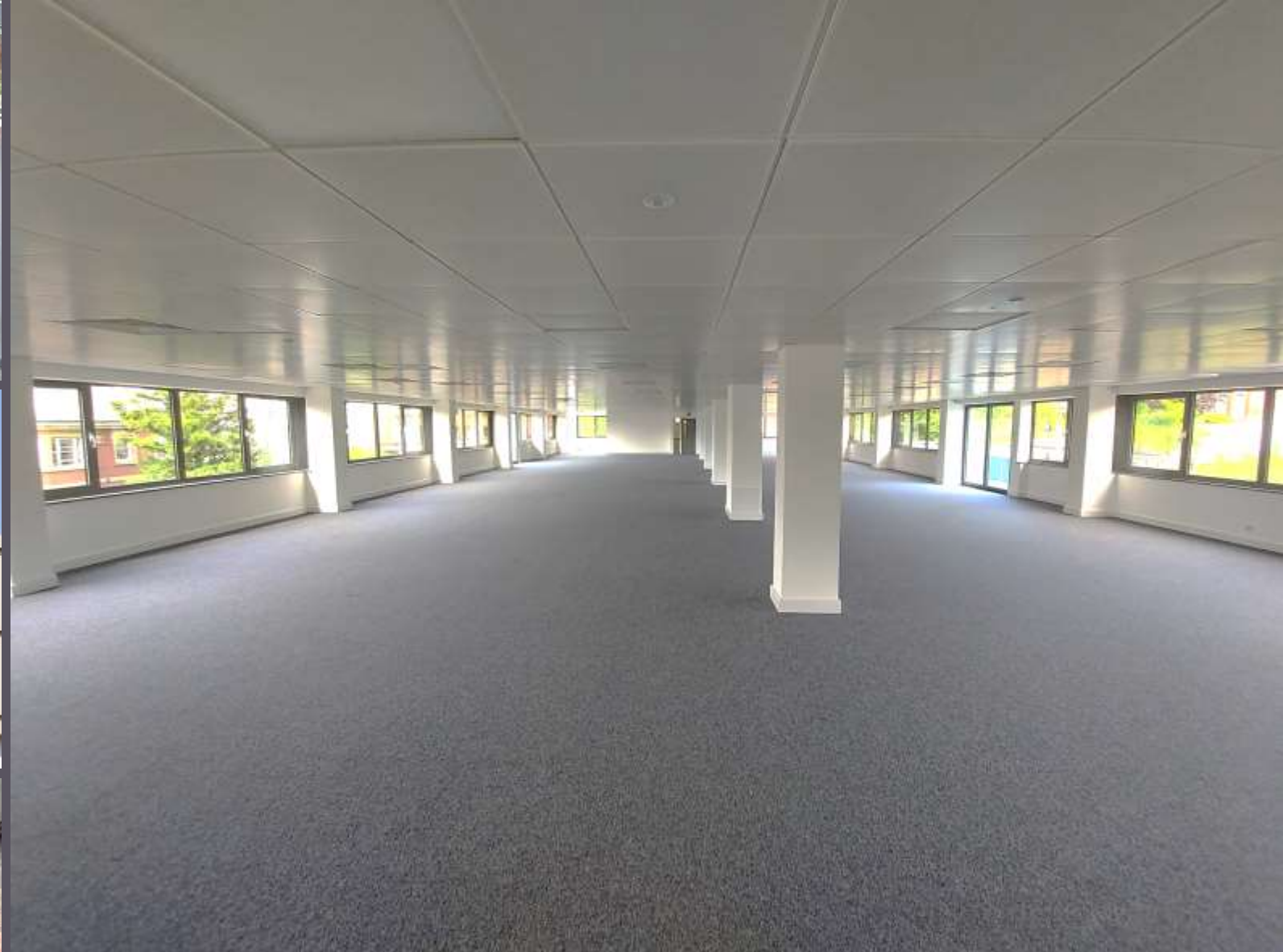
Mount Pleasant House – Tunbridge Wells