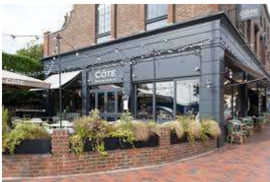
Mount Pleasant Road - Tunbridge Wells

Offices - Rent review advice and negotiations on behalf of a tenant.