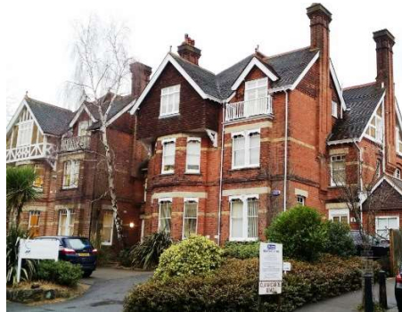
Tunbridge Wells - Offices & Medical