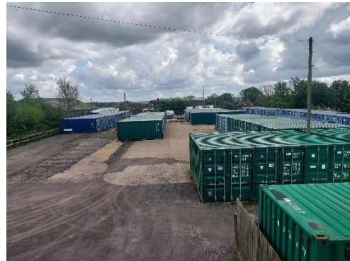
Bells Yew Green - Industrial land, warehouse and self-storage