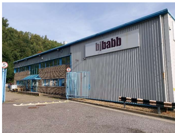
Chapman Way, Tunbridge Wells

Offices - Rent review and lease renewal advice and negotiations on behalf of the landlord.