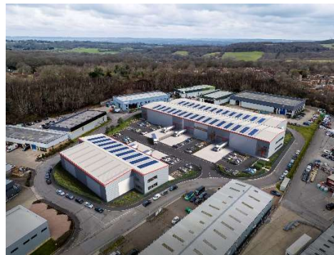
Tunbridge Wells - New Industrial & Warehouse Development