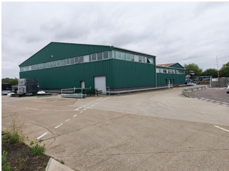
Paddock Wood - Industrial / Warehousing

We carry out a range of valuations across most asset classes for pension funds, company accounts, probate, matrimonial, development appraisals, etc - below is a selection of the types of properties we have advised on.