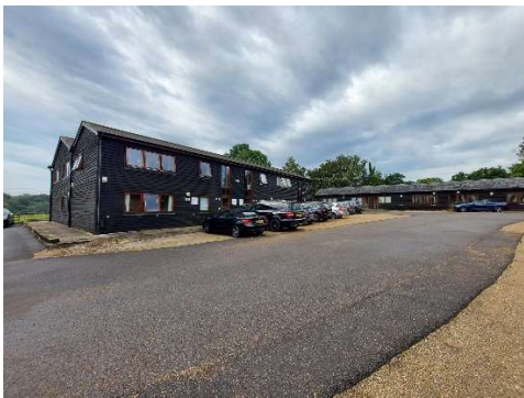
Speldhurst Business Park - Offices