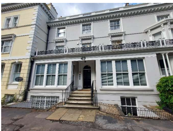
Richmond Terrace – London Road – Tunbridge Wells

Offices - Rent review advice and negotiations on behalf of the landlord.