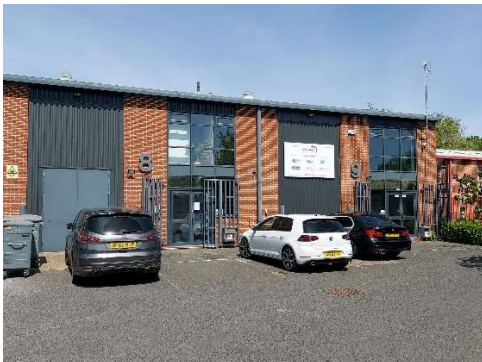
Tunbridge Wells - Light Industrial / Offices