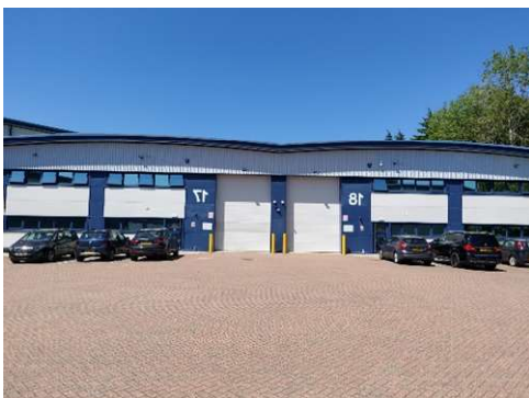
Tunbridge Wells - Warehouse & Production