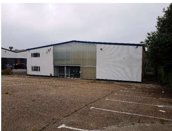
Longfield Road – Tunbridge Wells

Restaurant - Rent review advice and negotiations on behalf of the landlord.