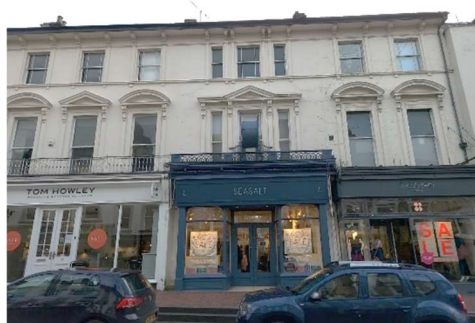
Tunbridge Wells - Retail Investment