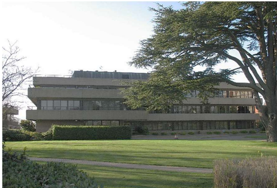
Brockbourne House – Tunbridge Wells

We have illustrated some examples below: