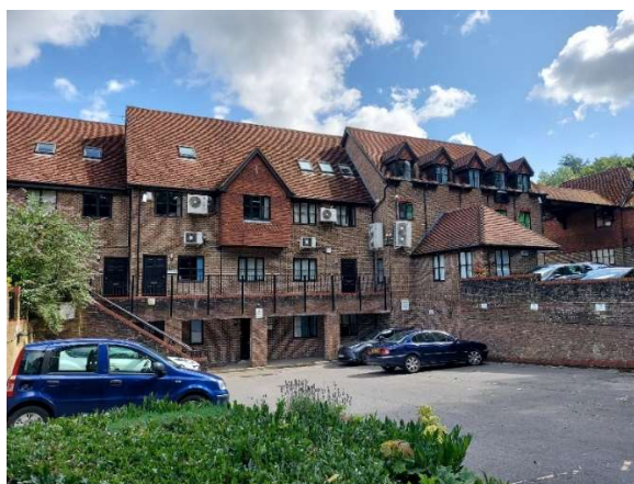
East Point – Seal (Sevenoaks)

Gym - Rent review advice and negotiations on behalf of the Landlord.