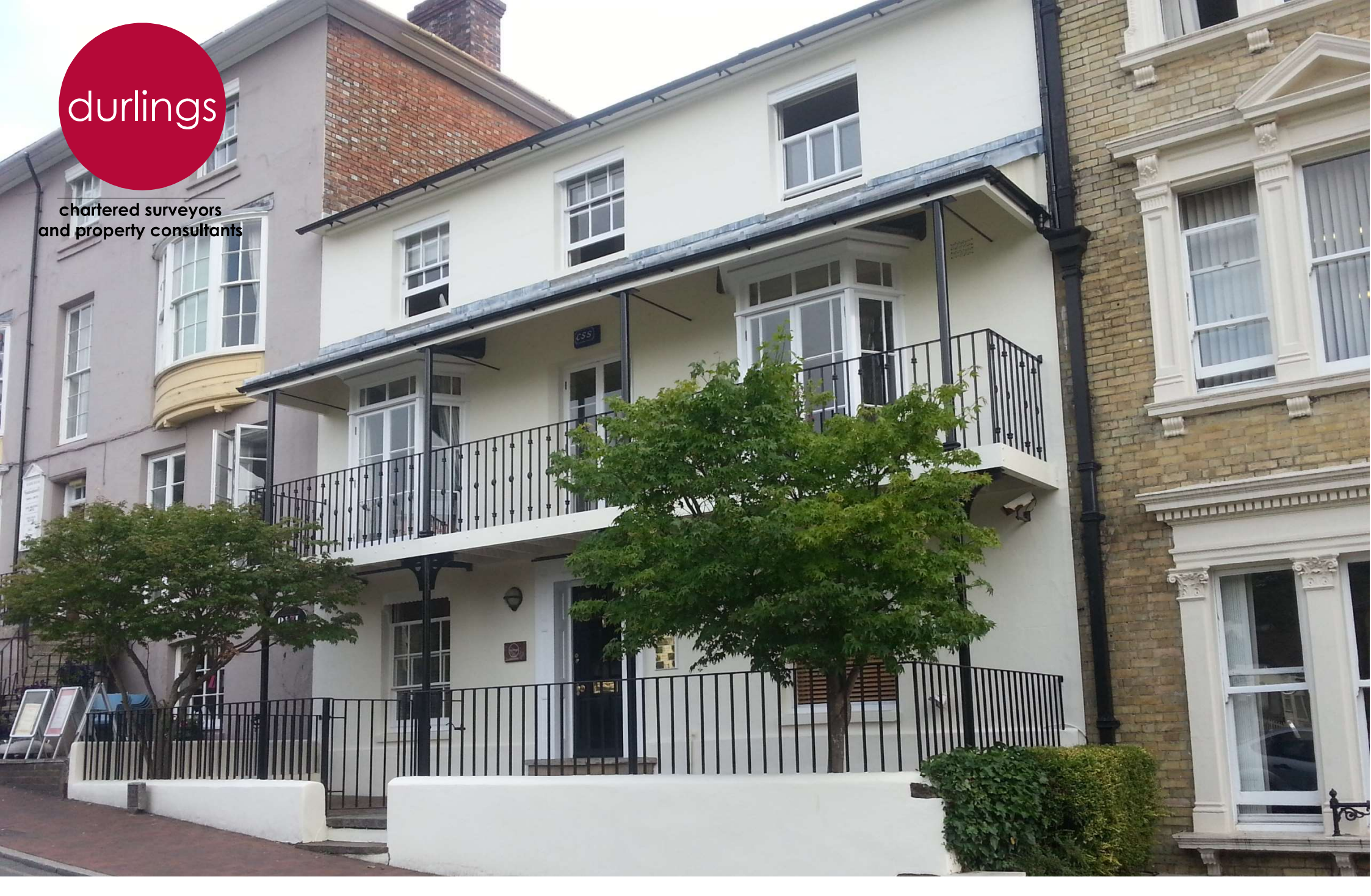
22 Mount Ephraim Road • Tunbridge Wells • Kent TN1 1ED Refurbished Offices in fine Grade II Listed Building – with a car space - To Let – 415 sq ft