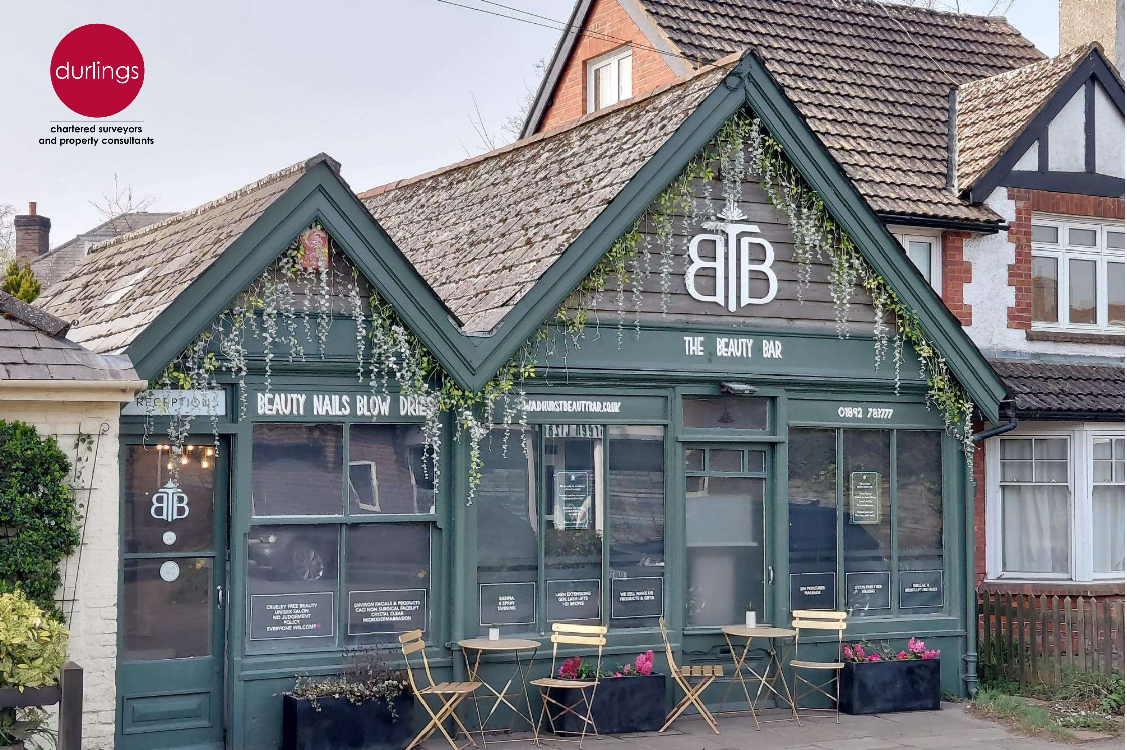
The Beauty Bar • Durgates • Wadhurst • East Sussex TN5 6DE Retail / Beauty Salon - For Sale - 737 sq ft (68.47 sq m)

chartered surveyors and property consultants