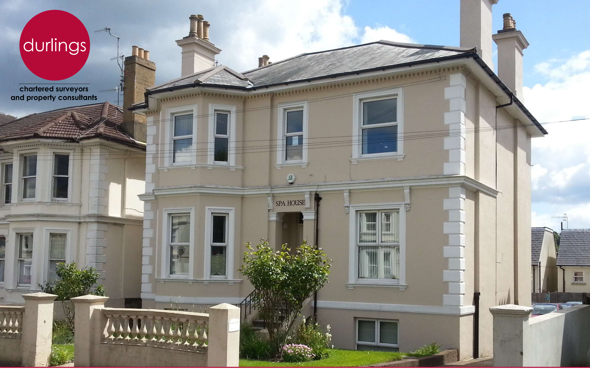
Spa House • 18 Upper Grosvenor Road • Tunbridge Wells • Kent TN1 2EP

Office Suite – Lease Assignment - 482 sq ft (44.78 sq m) – 2 car spaces