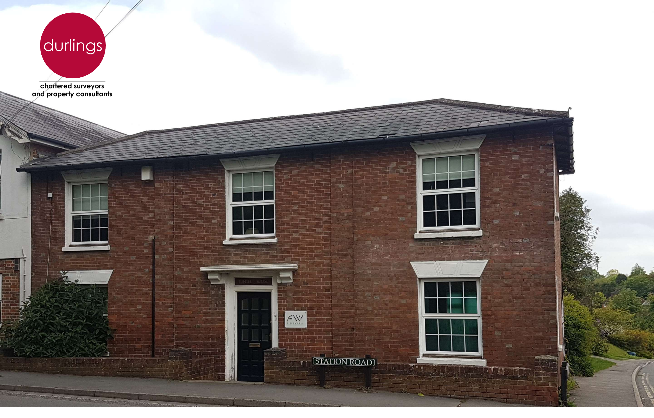
Tunnel House • Station Road • Durgates • Wadhurst • East Sussex • TN5 6DF

Office Building - To Let -1400 sq ft - with large car park