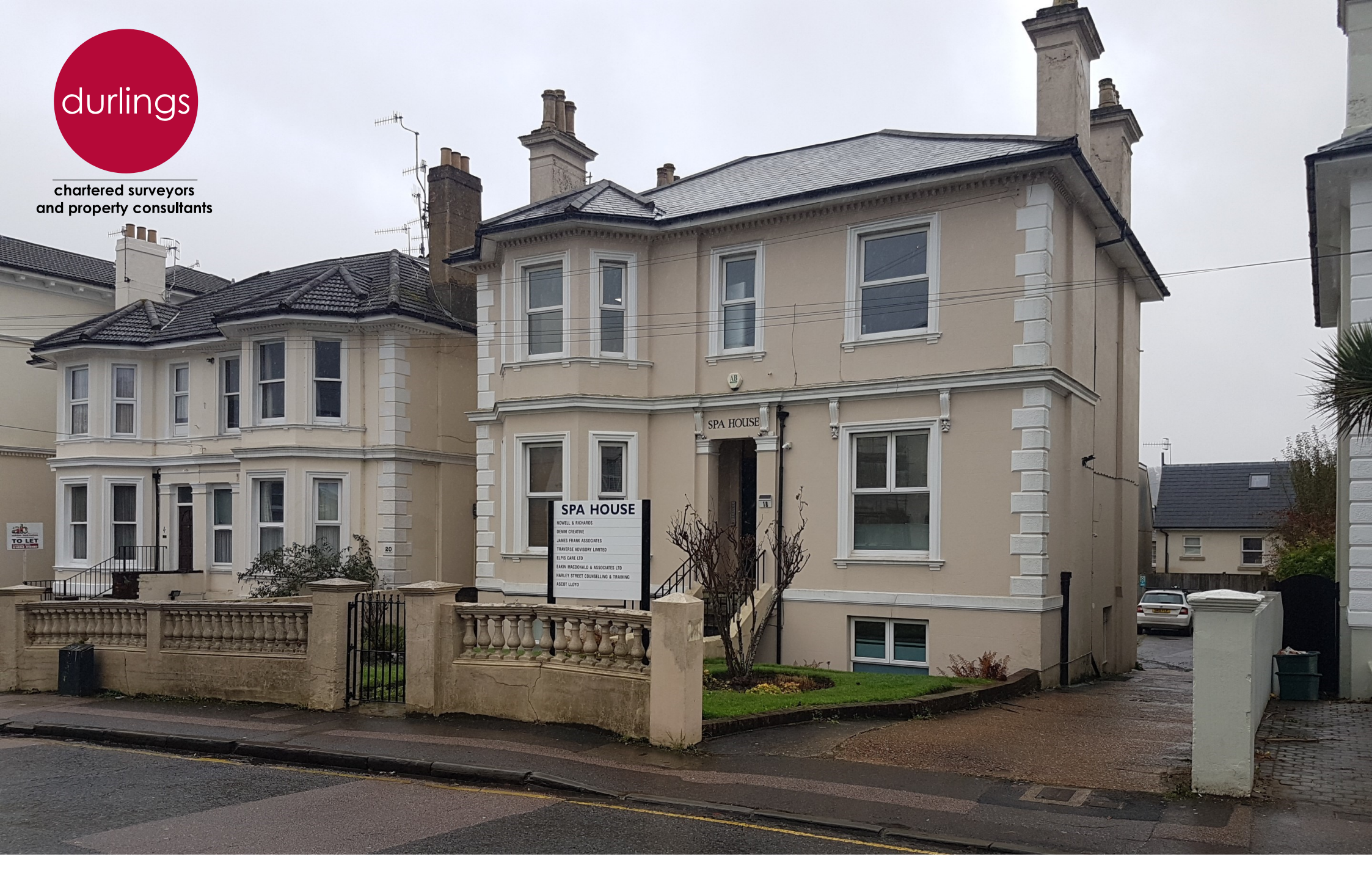
Spa House • 18 Upper Grosvenor Road • Tunbridge Wells • Kent TN1 2EP

Refurbished Office Suite - To Let - 340 sq ft (31.59 sq m)