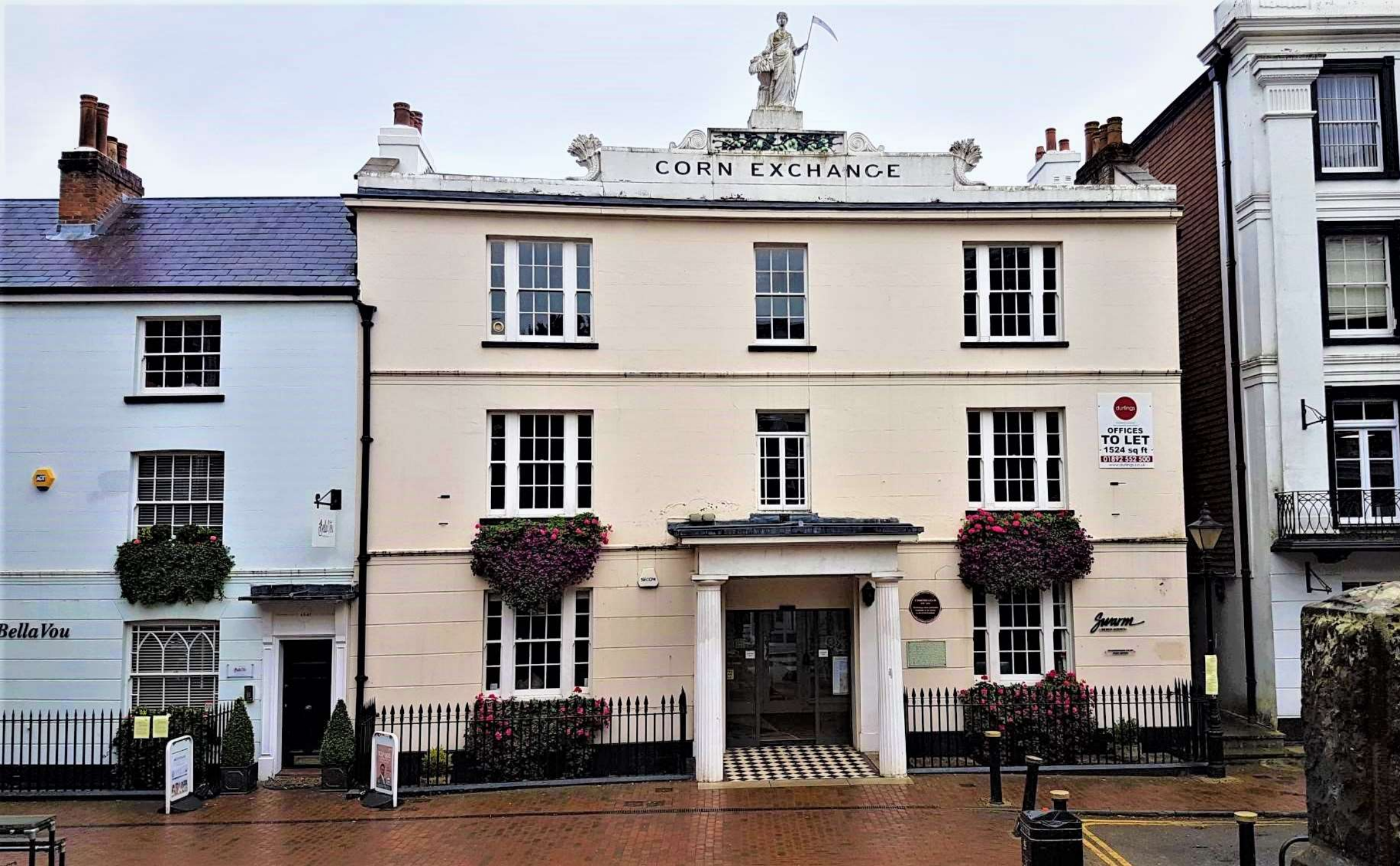
The Corn Exchange • The Pantiles • Royal Tunbridge Wells • Kent TN2 8AA Small newly refurbished office suites in unique grade II listed building - To Let – 146-319 sq ft