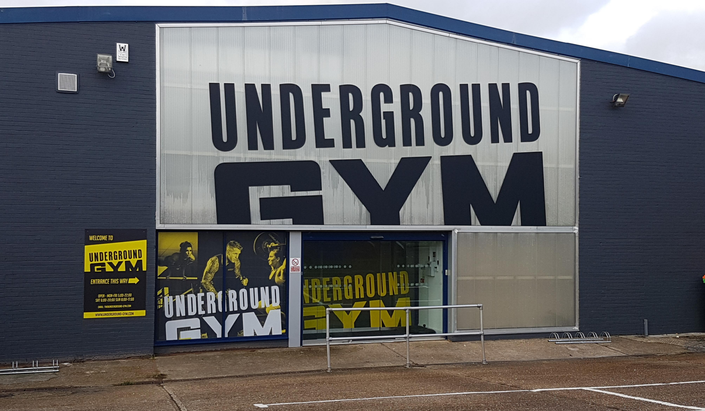
Underground Gym opens in Tunbridge Wells