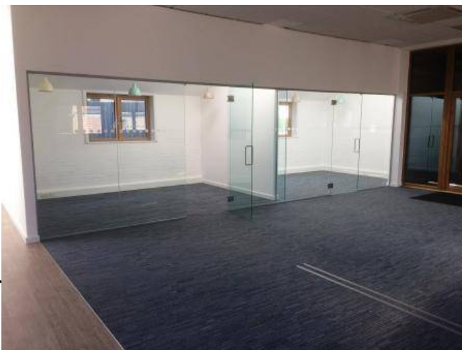
Photographs of Unit 1