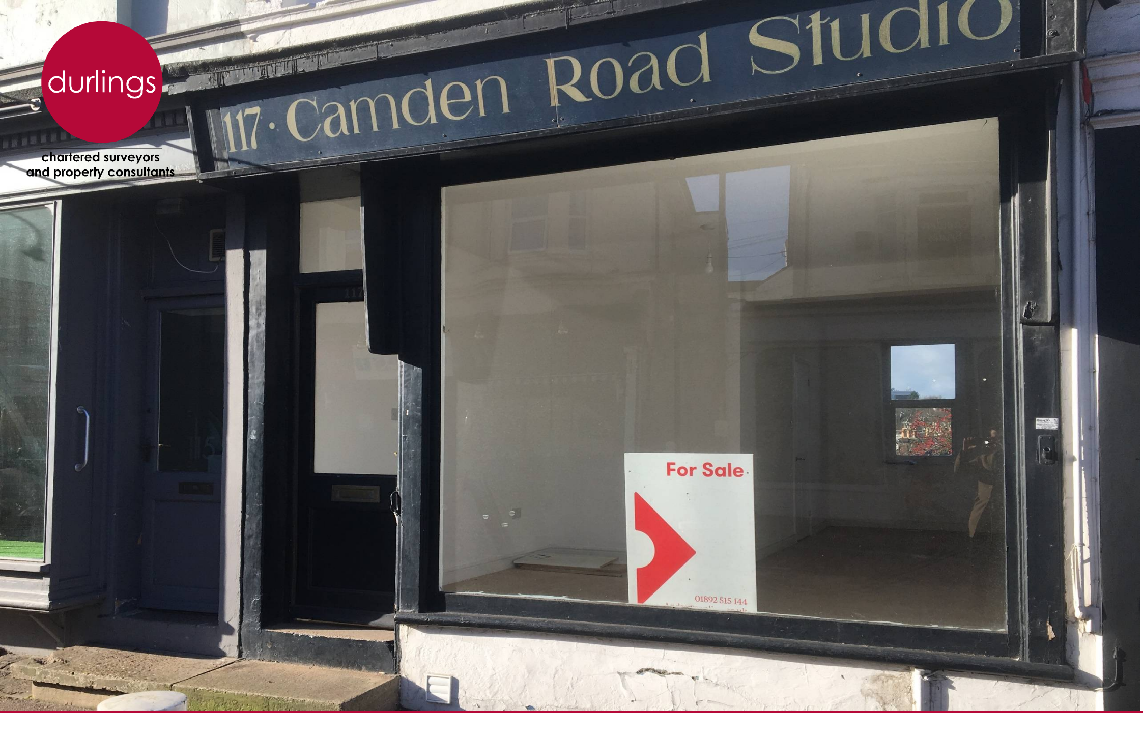
117 Camden Road • Tunbridge Wells • Kent • TN1 2QY Lock Up Retail Unit - To Let