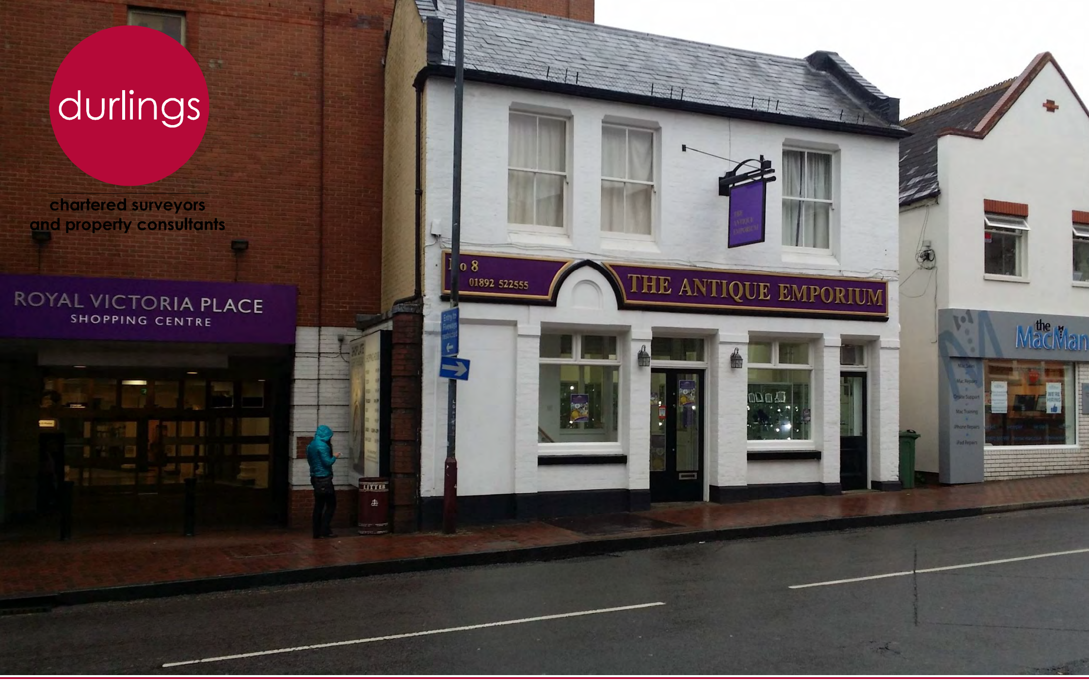
The Antique Emporium • 8 Goods Station Road • Tunbridge Wells • Kent TN1 2BJ

Retail / Showroom Premises & 3 bedroom apartment - For Sale