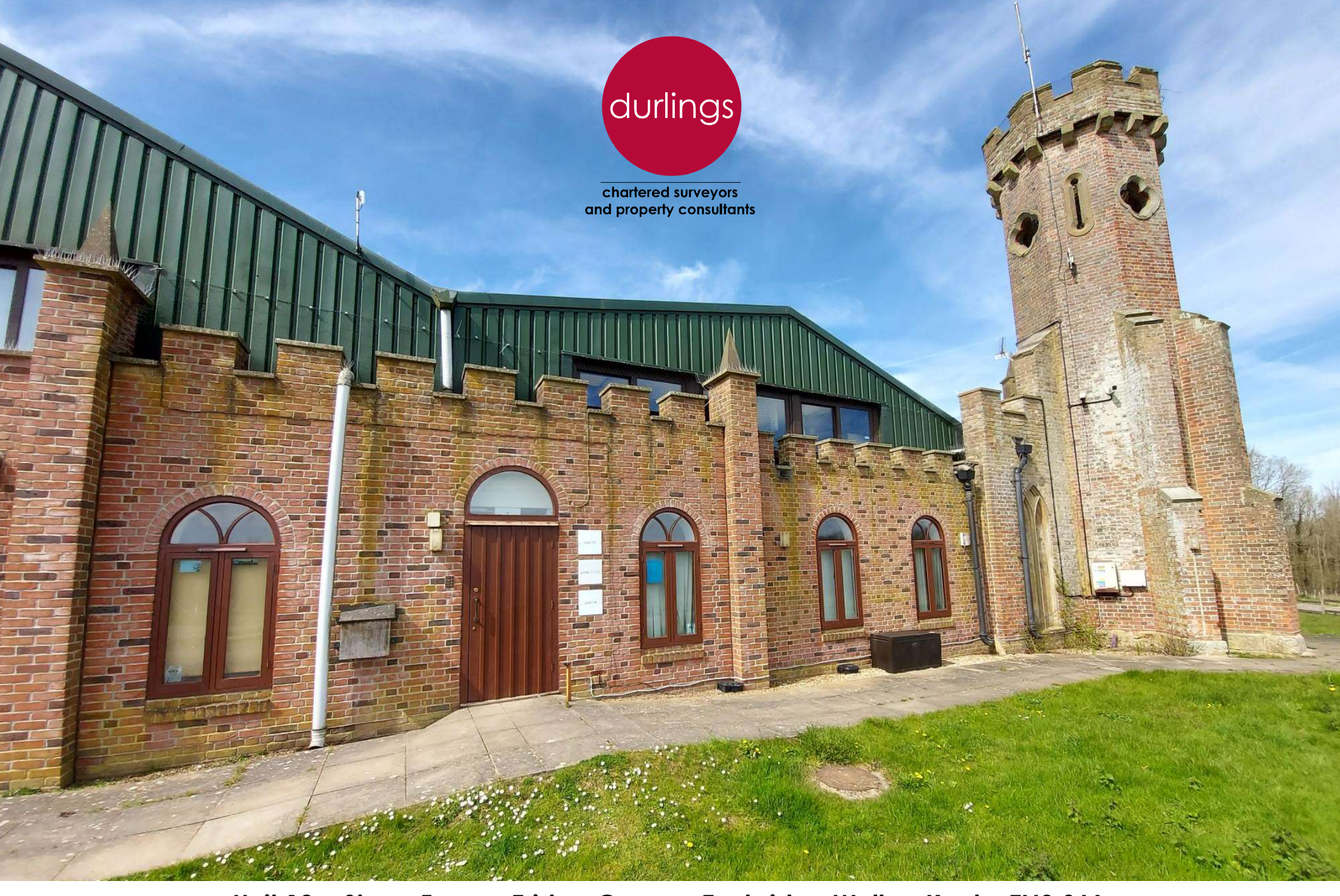
Unit 12 • Sham Farm • Eridge Green • Tunbridge Wells • Kent • TN3 9JA Office - To Let – 584 sq ft (or 1659 sq ft) - 100 mgb internet speed available