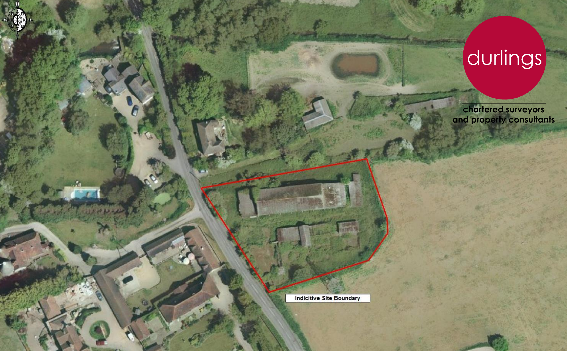
The Old Dairy • Barden Road • Speldhurst (Tunbridge Wells) • Kent TN3 0LH

Residential Development Site . For Sale . Planning Consent for 3 Houses