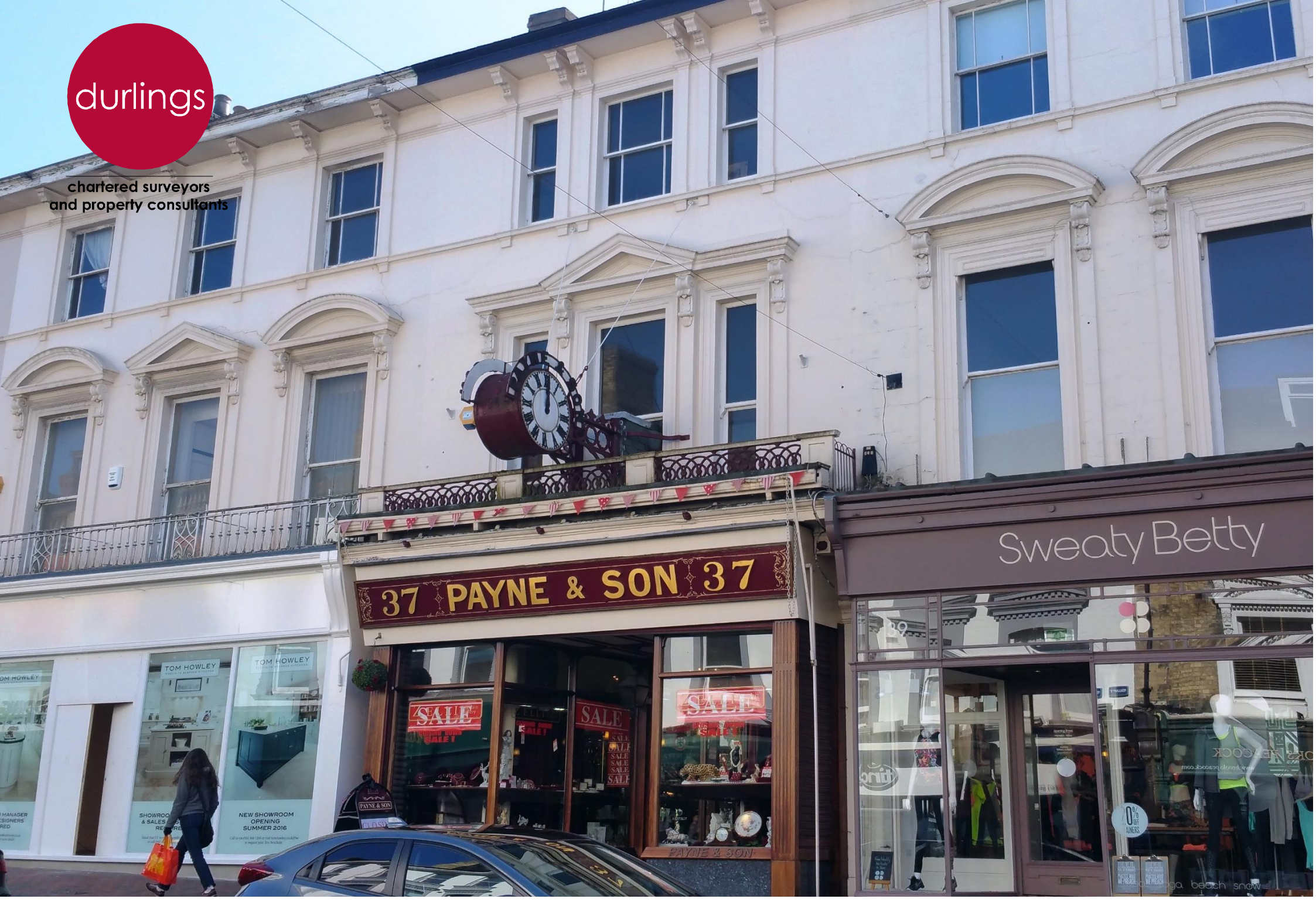
Retail / Showroom Building - To Let - 37 High Street • Tunbridge Wells • Kent TN1 1XL