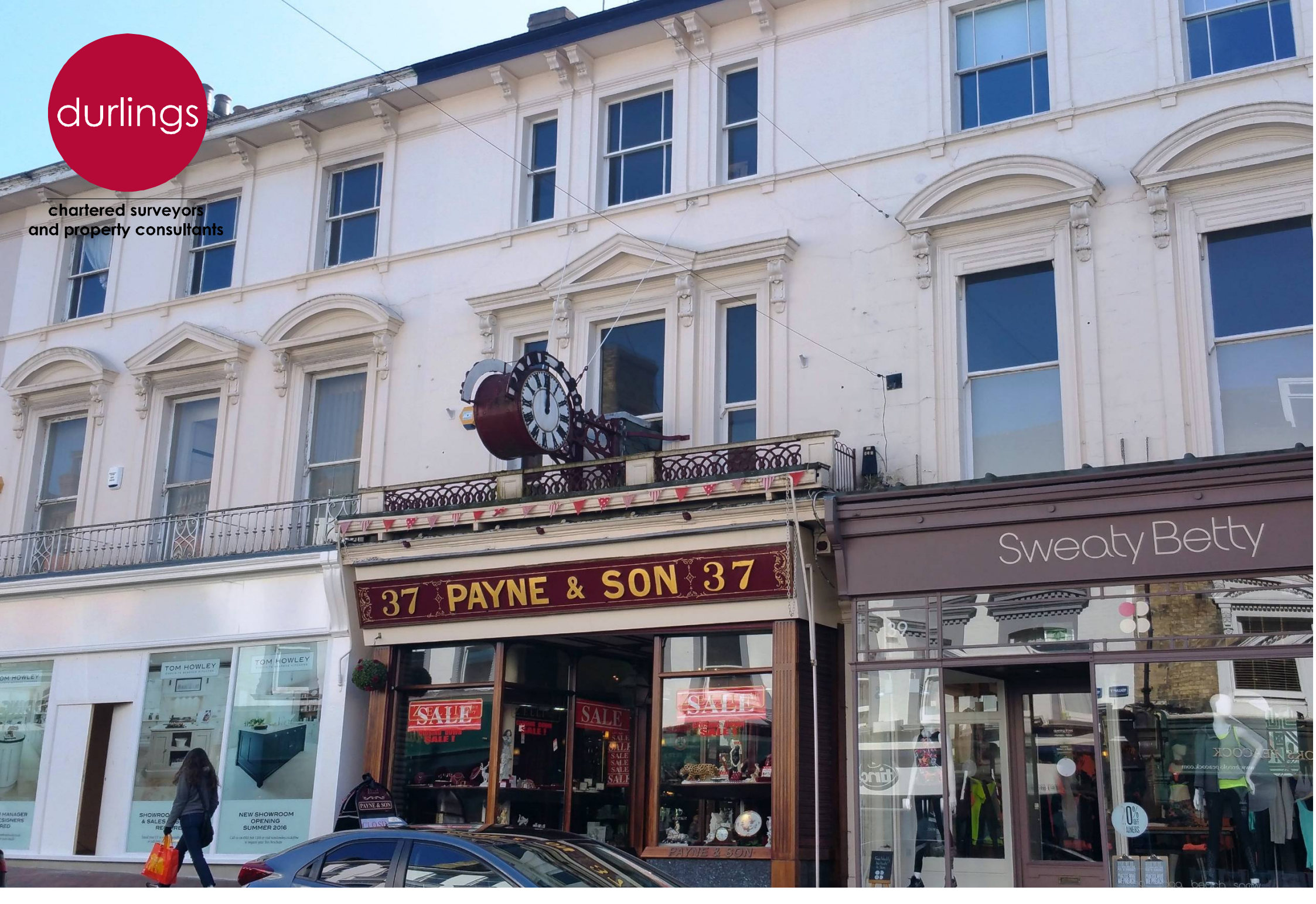
Retail / Showroom Building - To Let - Clock House, 37 High Street • Tunbridge Wells • Kent TN1 1XL